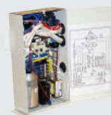
Standard remote mount electrical box with electrical diagram

Each FCF unit comes standard with a 4 or 5 inch ducting collar, high velocity 360 degree rotatable blower, remote mount electrical box, digital control with bezel, remote control, air filter, and reverse cycle heat.