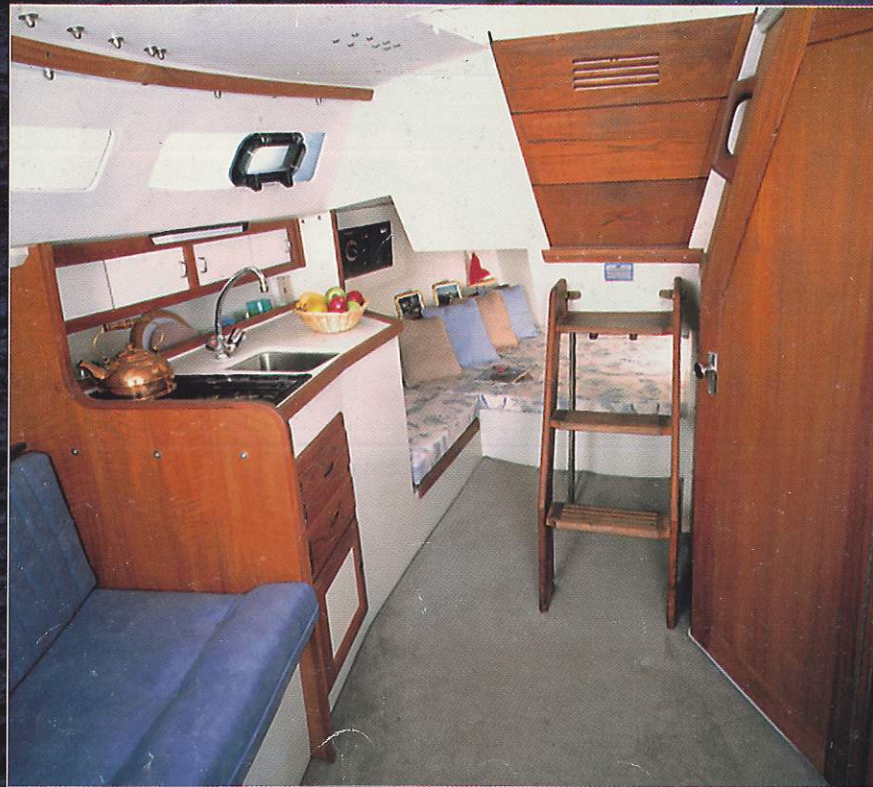
The main cabin, view aft. The aft berth has a port overhead for light and ventilation, via the cockpit