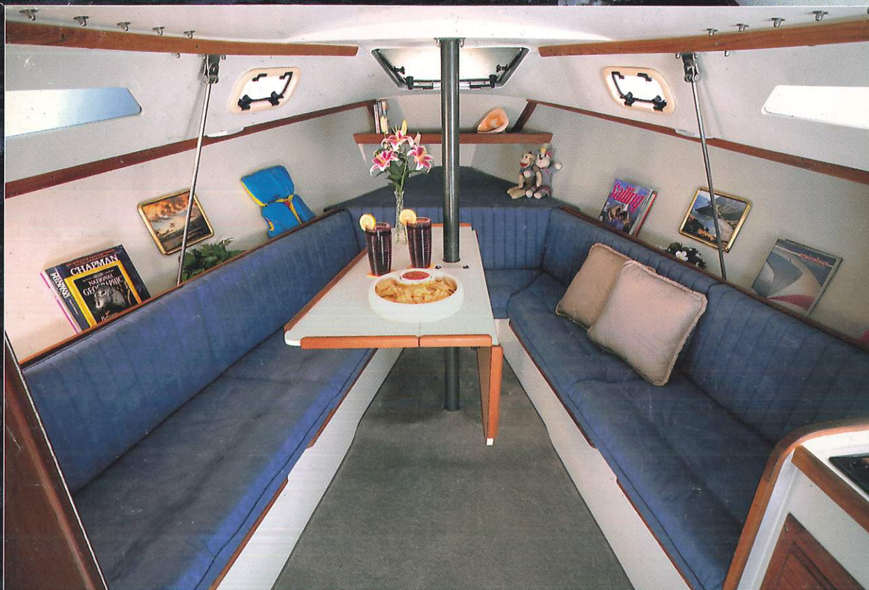
The main cabin, view forward. The drop leaf table accommodates six for meals.

The true test of a sailboat design is how much fun it is to sail, to be aboard, to own. These tests the Capri 26 passes with flying colors.