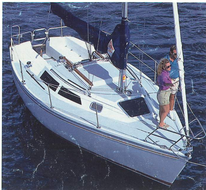
Photos and drawings may show optional equipment. Refer to current price sheet for standard equipment list and specifications.