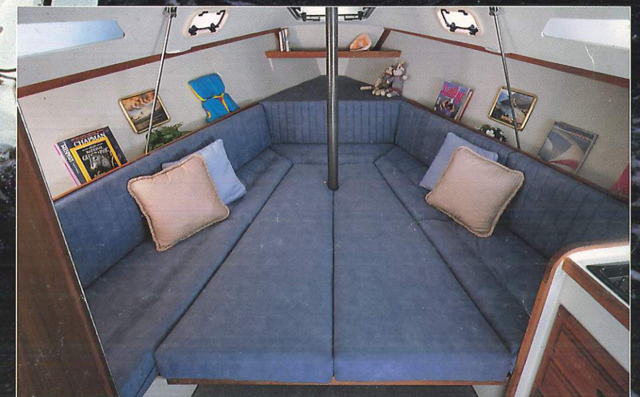
The settees and lowered table convert to a large bunk. The vee berth forward is perfect for kids or can be used as a handy storage area.