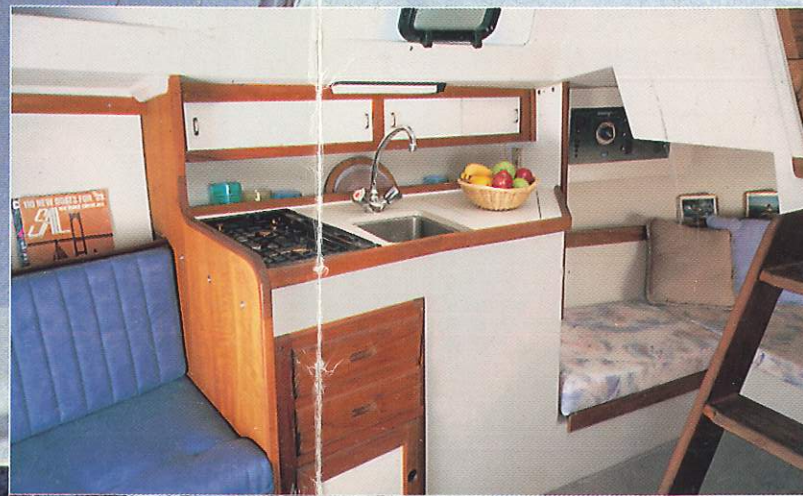
The galley contains a large insulated icebox, two burner recessed stove, a sink and fresh water system, storage is behind, above and below the galley counter